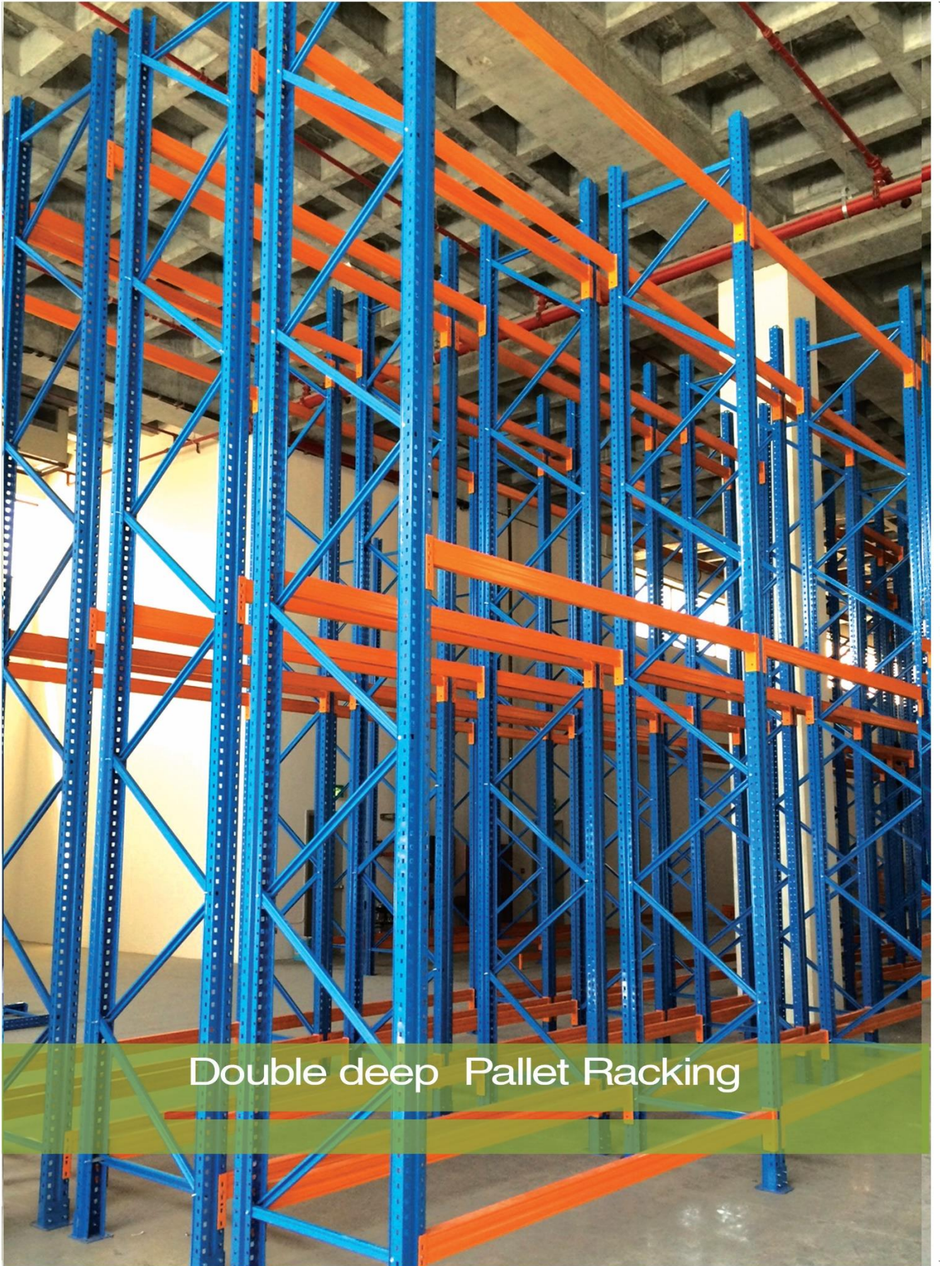
Double deep Pallet Racking